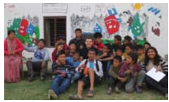
Wall painted by the ENPHO/PaschimPaaila team with the information on safe water and hygiene.

Smaart Paani exhibited the model of Rainwater harvesting in three different venues; Civil Homes Phase III, Sunakothi; Nagbahal, Patan; Rose Village Housing, Balkot, Bhaktapur to raise awareness on the importance of RWH and it made it easy to implement features.