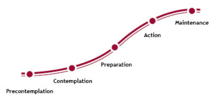
Figure 5.1: Stages of Behavior Change