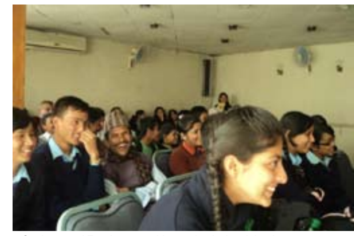
Students and Teachers watching and enjoying Jalpari organized by CEN

waste management focusing on replacing plastic bags with cotton ones. Participants from two schools of Kathmandu valley were present in the event held at Mangal Bazzar, Patan Durbar Square on 26th February 2013. Video of the whole event was also captured for producing documentary for the future.