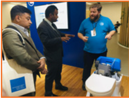
Reinvented Toilet Technology at the EXPO

The dream for an ideal toilet that kills 100 percent pathogens, uses minimum water, and produces resources such as energy, clean water, and fertilizers has come true. The grantee of the BMGF at the Reinvented Toilet Expo has proved that new toilets in the 21 st Century are possible. Government of Nepal, now, should take leadership role and take a proactive move to tap these opportunities and collaborate with all to bring these solutions in the market that make the citizen healthy and country prosperous.