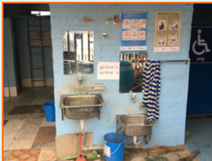
AEROSAN Hub Public Toilet in Ratnapark

Public toilets provide value that goes beyond providing a basic service to those in need for a place to relieve themselves. Nepal is trying to encourage more tourists to visit the country, especially with Visit Nepal 2020 Campaign. In 2017, the number of tourists who visited Nepal was 940,218. This number is expected to grow every year. And while these tourists visit the places around Nepal, they would need sanitary public toilets for their use, especially in dense urban cities like Kathmandu and Pokhara. Having well functioning public toilets near highly touristic areas would add to the experience of the tourists visiting Nepal.